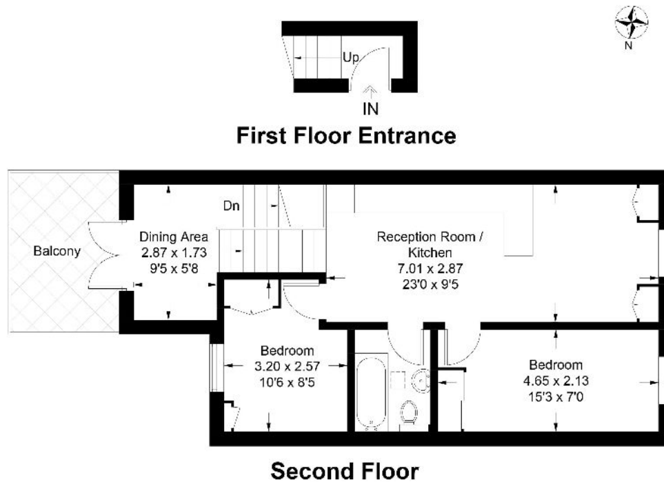
Illustration for identification purposes only, measurements are approximate, not to scale. Copyright © M2 Property Limited

Approximate Gross Internal Area = 55.74 sq m / 600 sq ft