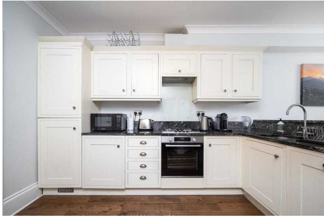
A bright and beautifully-presented two bedroom apartment in Earls Court